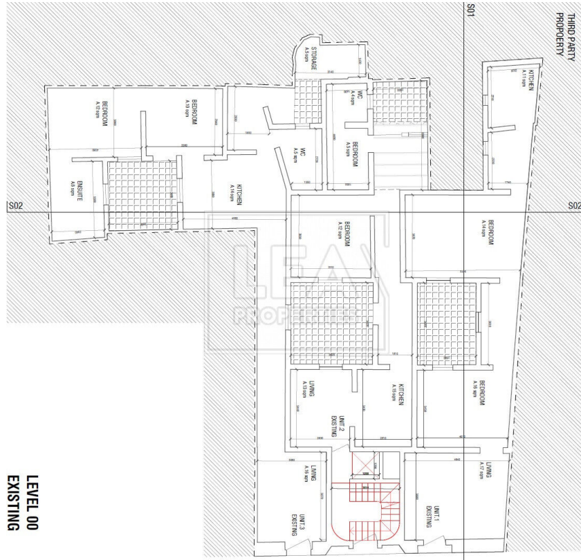
LEVEL 00 EXISTING