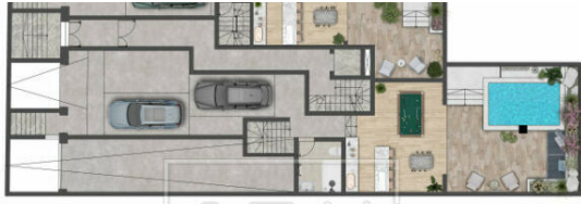
Duplex Maisonette Semi-basement level plan