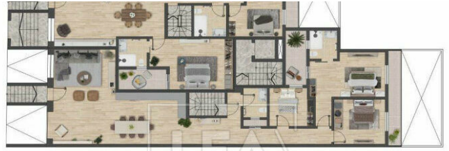
Duplex Maisonette ground floor plan