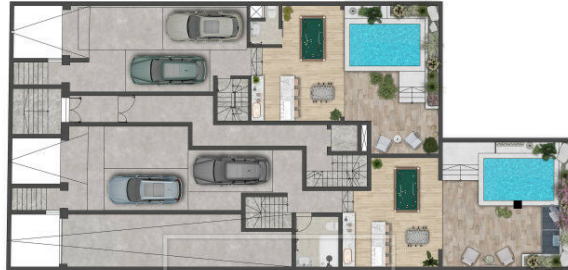
Duplex Maisonette Semi-basement level plan